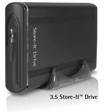
3.5 Store-It™ Drive