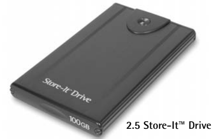
2.5 Store-It™ Drive

© 2008 Pexagon Technology, Inc. Retrospect® is a registered trademark of EMC Insignia. Store-It™, and EZ-Touch™ are trademarks of Pexagon Technology, Inc. All other trademarks are the property of their respective companies.